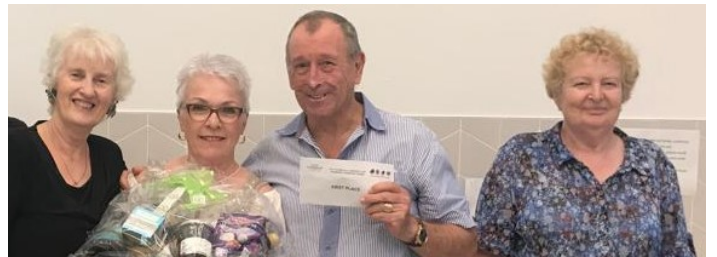
Above: Congress Teams Hardie team Winners