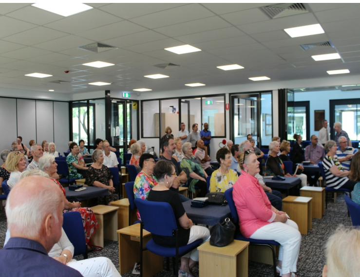
Grand opening of our clubhouse