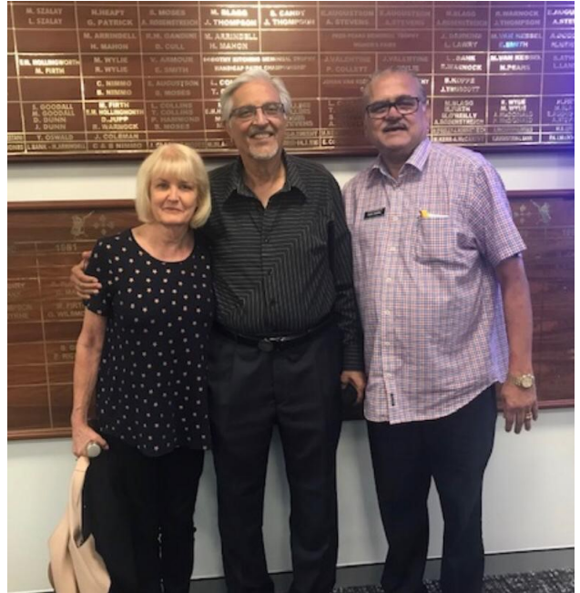
Oakwood Congress Pairs Qualifying North/South