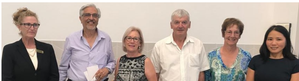
Oakwood Congress Teams 2nd Gammon Team