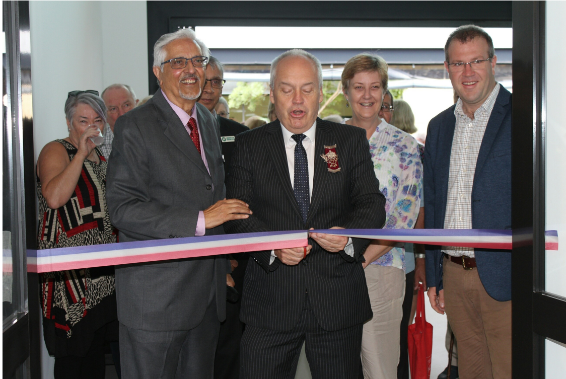
Left: mayor of the City of Melville cuts the ribbon