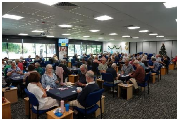
The celebration playing group